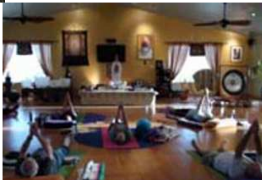
The Yoga Room at Sage Hills