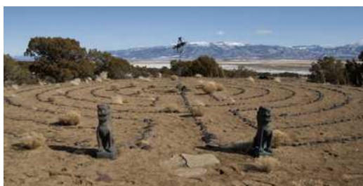
The Labyrinth at Sage Hills